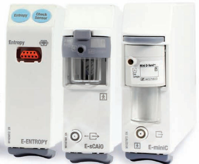
CARESCAPE* Respiratory Modules

The B40 Monitor makes it easy to acquire accurate patient data to support timely decision-making.