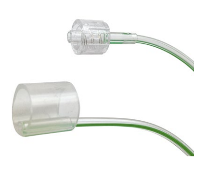
878003, 878004, 878005

E-CO, E-COV, E-COVX, E-CAiO, E-CAiOV, E-CAiOVX, E-SCO, E-SCOV, E-SCAiO, E-SCAiOV, E-SCAiOE, E-SCAiOVE, E- miniC